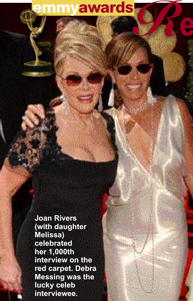
Joan Rivers (with daughter Melissa) celebrated her 1,000th interview on the red carpet. Debra Messing was the lucky celeb interviewee.

Joan and Melissa Rivers weigh in on Emmy fashion